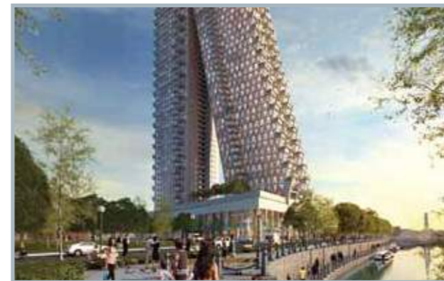
Altair | Colombo