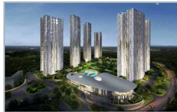
Urbana | EM Bypass, Kolkata