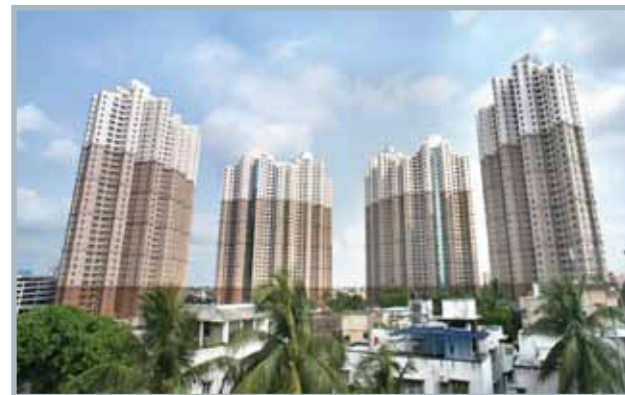
South City Residence | Kolkata